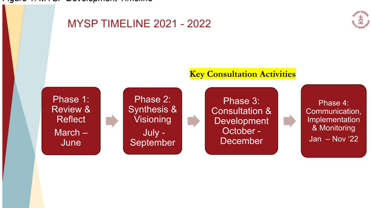
Figure 1: MYSP Development Timeline

This document presents the consultation plan and recommended activities to take place in the fall of 2021, along with suggested roles and responsibilities. It was created by Maximum City in consultation with staff, and is informed by the Board's Community Engagement Policy. As noted in the policy, effective consultation of stakeholders aligns with multiple priorities in the current MYSP, including Strengthening Public Confidence and Fostering Student Achievement and Well-being. A strong community engagement program for the new MYSP will build relationships and a sense of belonging and purpose among participants, while respecting their right to be involved in Board decisions and policy direction.