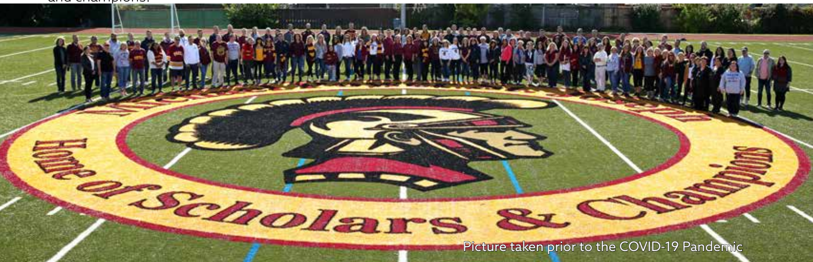
Picture taken prior to the COVID-19 Pandemic

It is with absolute pride and enthusiasm that we share the Michael Power-St. Joseph experience with you. Leadership, participation, school spirit, the pursuit of excellence and daily contribution to the Catholic culture and community serve as the foundation of our school. Welcome to Michael Power • St. Joseph, the home of scholars and champions!