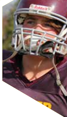
Pictures taken prior to the COVID-19 Pandemic