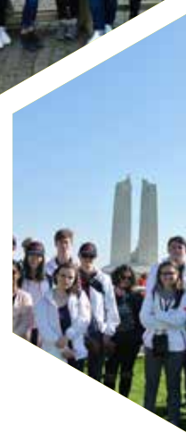
Pictures taken prior to the COVID-19 Pandemic