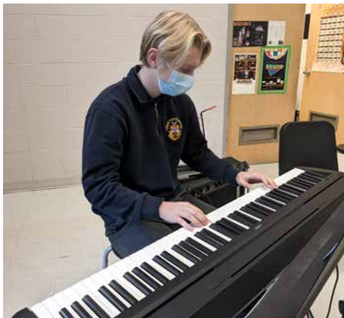
When opportunity knocks...answer!