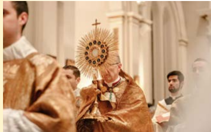
5 Ways to Celebrate Corpus Christi as a Family